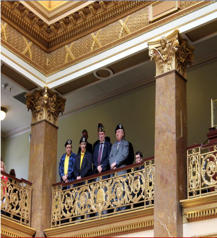
Vietnam War Veterans being honored in the Utah House of Representatives Gallery.